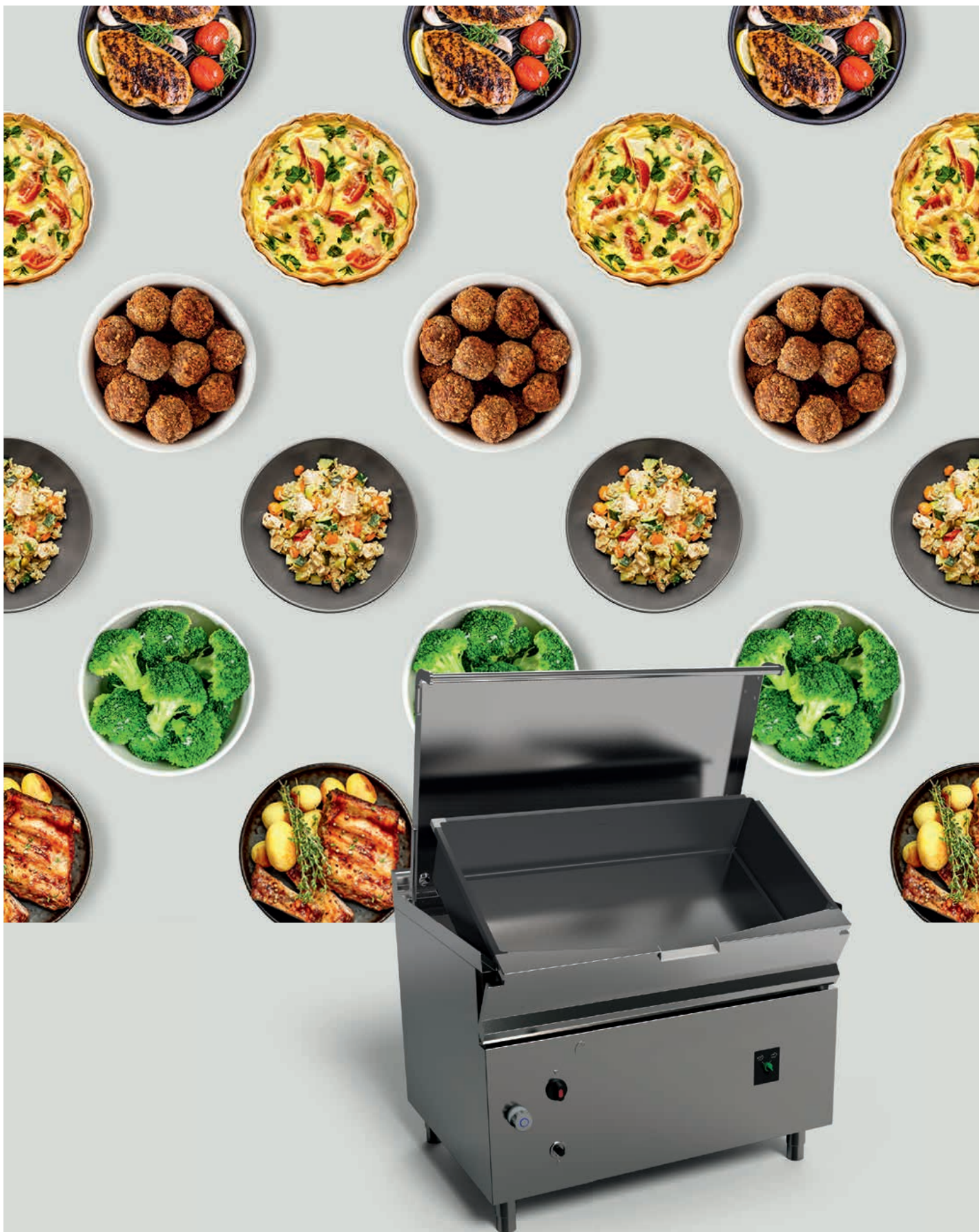
Easybratt Tilting bratt pan